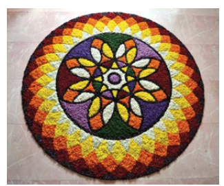
Twin Info Solutions

The Mahabali's Crystal Award trophy was presented to the CSS Abu Dhabi office