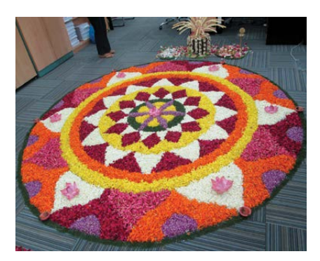
CSS Abu Dhabi