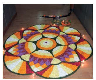
CSS Head Office

at a recently held gathering at The Club in Abu Dhabi on September 27th, 2013.