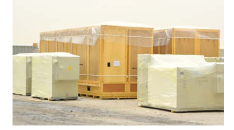
was displayed by each and every department of CSS involved in the process and ensured highest client satisfaction in executing such time sensitive works as always.